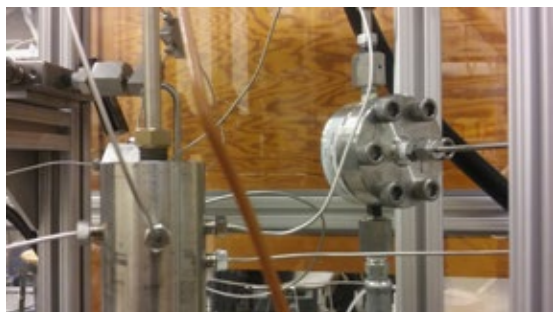
Figure 3: Equilibar U6L installed in lab

Figure 3 is a photograph of the Equilibar U6L in use in the lab equipment. Nitrogen gas is used to supply the pilot setpoint to the Equilibar U6L regulator.