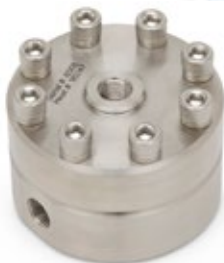
Figure 2: Equilibar U6L Low Flow back pressure regulator

The Ultra Low Flow UL Series uses a single outlet orifice design.